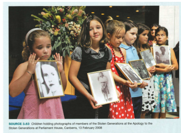
Figure 2: Group of children 2